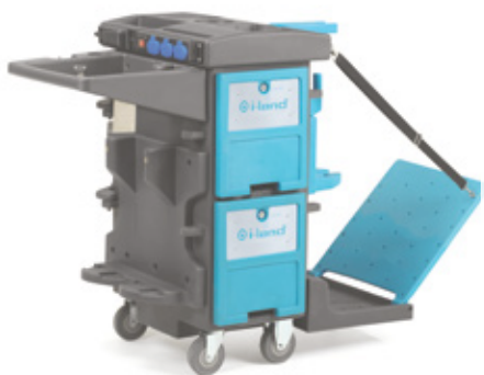
i-land L Pro