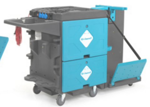
i-land XXL Pro