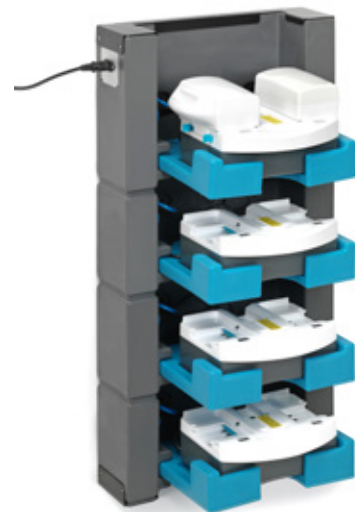
i-stack 4 4 layers