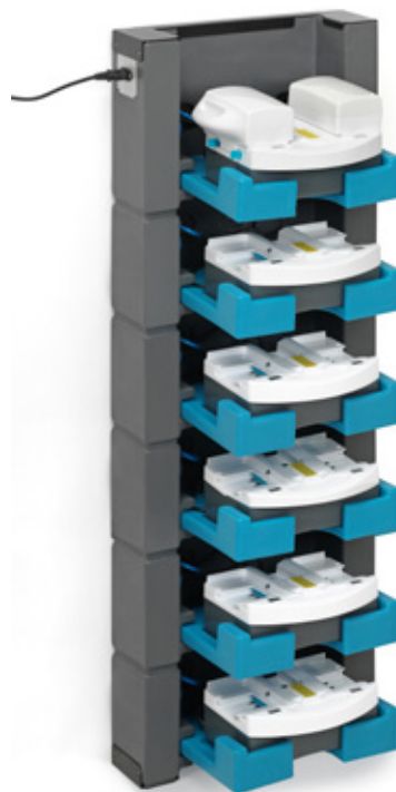
i-stack 6 6 layers