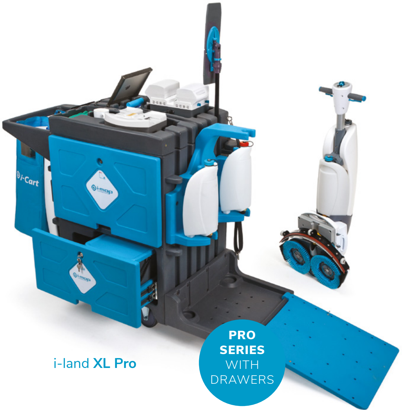
i-land XL Pro