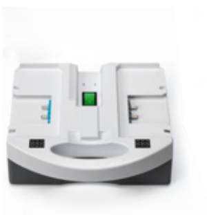
i-charge 2 K.1.S.72.0299.0