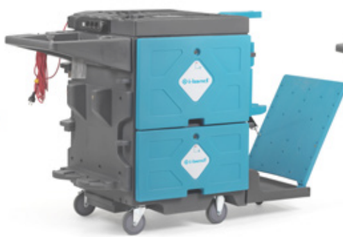
i-land XL Pro