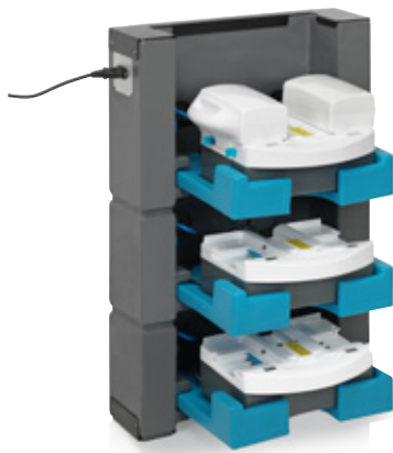
i-stack 3 3 layers

That's why we thought: why not use the vertical option towards the ceiling for charging your batteries? You only need one power socket for multiple chargers. Now you can easily attach, hook-up, and power your batteries without losing precious space!