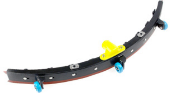
For oily/greasy environments