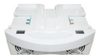
i-charge 9 K.1.S.72.0344.0